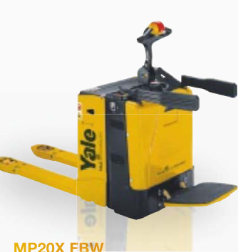
MP20X FBW 2,000kg