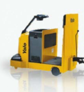
MTR005-007F 2,250kg - 3,200kg