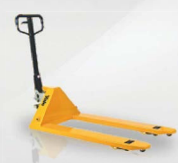
PREMIUM PALLET JACK 2,500kg