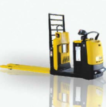
MO20-25 2,000kg - 2,500kg