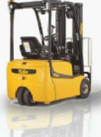
ERP030-040VT 1,360kg - 1,800kg