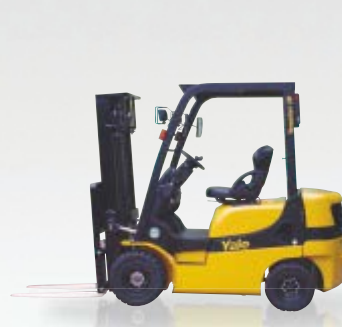
GP20-35MX 2,000kg - 3,500kg