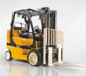
GC080-120VX 3,600kg - 5,450kg