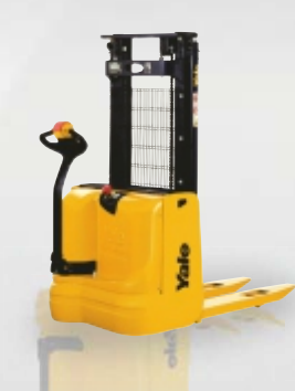
MS10-16 AC 1,000kg - 1,600kg