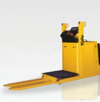
MO10E AC 1,000kg