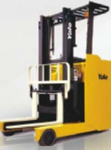
FBR13-18S(W)Z, FBR20-30S(T)Y 1,250kg - 3,000kg