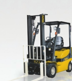
GP15-20SMX 1,500kg - 2,000kg