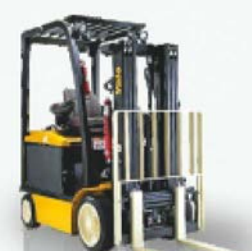
ERC045-070VG 2,000kg - 3,150kg