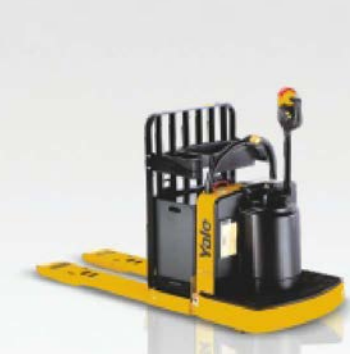
MPE060F, MPE060-080VG 2,700kg - 3,600kg