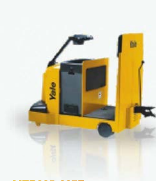
MTR005-007F 2,250kg - 3,200kg