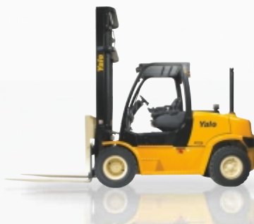
GP135-155VX 6,000kg - 7,000kg