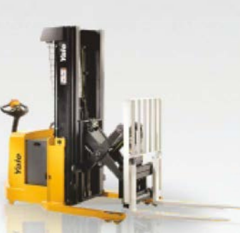
MRW020-030E 900kg - 1,350kg