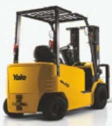
FB15-30PZ, FB35-40PYE 1,500kg - 4,000kg