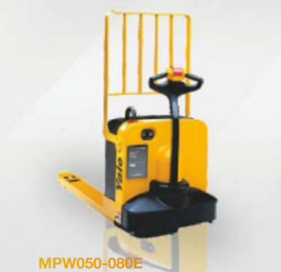
MPW050-080E 2,250kg - 3,600kg