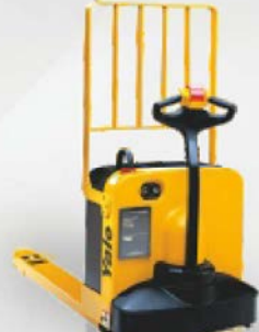
MPW050-080E 2,250kg - 3,600kg