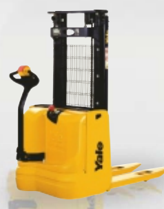
MS10-16 AC 1,000kg - 1,600kg