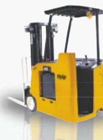
ESC030-040AD 1,350kg - 1,800kg