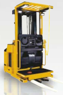
OS030EF/BF, SS030BF, FS030BF 1,350kg