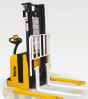
MSW025-030F, MSW040E 1,100kg - 1,800kg