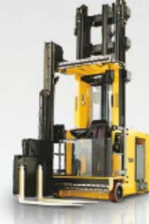
MTC10-15L 1,000kg - 1,500kg