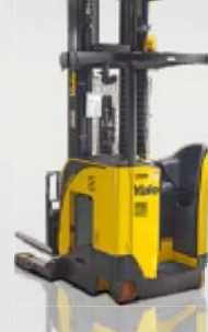
NR035-045EB, NDR030-035EB, NR035-040DB, NDR030DB 1,350kg - 2,000kg