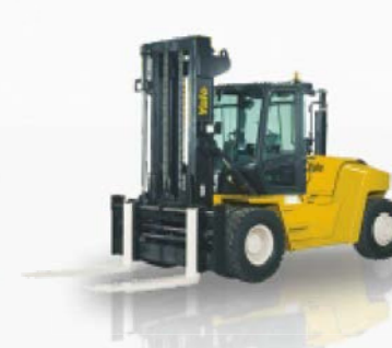
GP080-120DC, GP130-160EC 8,000kg - 16,000kg