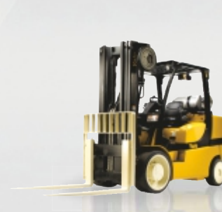
GC135-155VX 6,000kg - 7,000kg