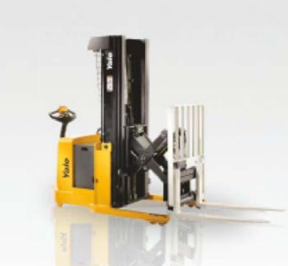
MRW020-030E 900kg - 1,350kg