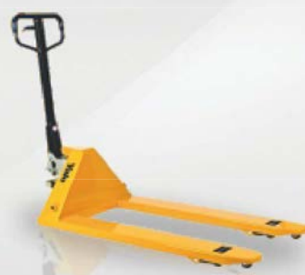
PREMIUM PALLET JACK 2,500kg