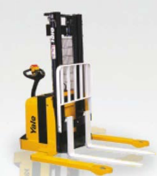
MSW025-030F, MSW040E 1,100kg - 1,800kg