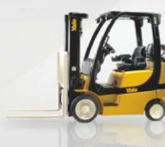
GC040-070VX 2,000kg - 3,500kg