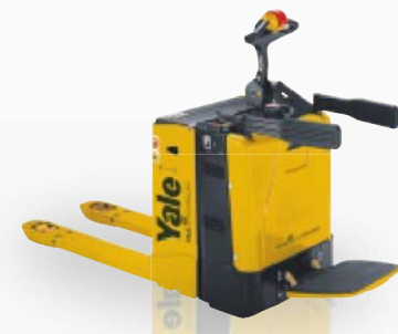
MP20X FBW 2,000kg