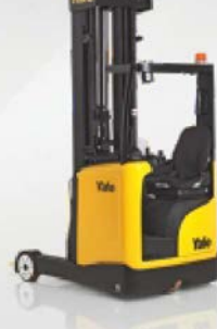
MR14-25 1,400kg - 2,500kg