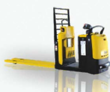
MO20-25 2,000kg - 2,500kg