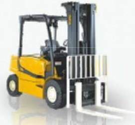
ERP40-55VM 4,000kg - 5,500kg