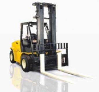
GP170-190VX 8,000kg - 9,000kg