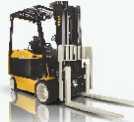
ERC080-120VH 3,600kg - 5,400kg