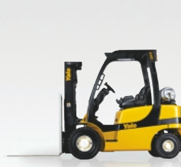
GP40-55VX 4,000kg - 5,500kg