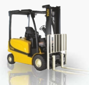
ERP030-040VF 1,360kg - 1,800kg