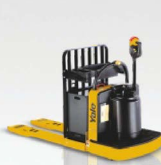
MPE060F, MPE060-080VG 2,700kg - 3,600kg